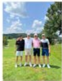
First Place Team Victory