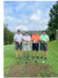
Third Place Neighborhood Automotive