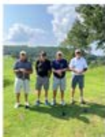
Second Place Maple View Christian Church Team 5