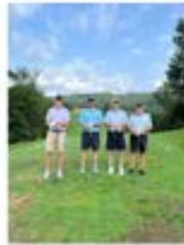
First Place RCM Properties