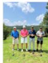
Third Place The Old Fogies