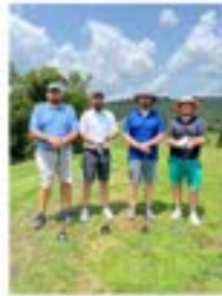
Second Place AAA Paving & Sealing